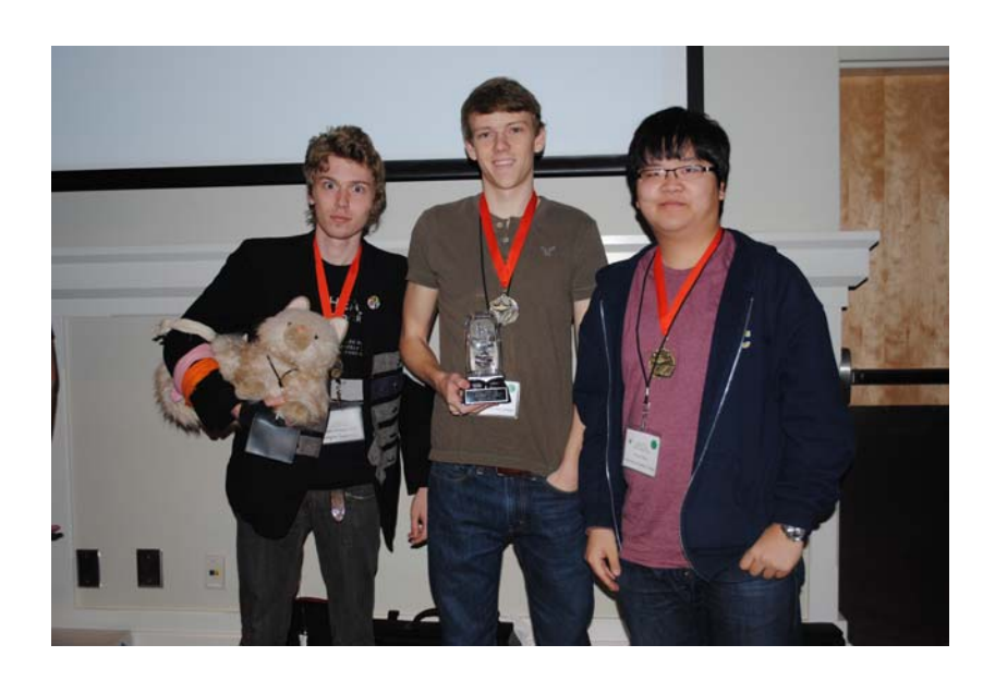
See you next year at Winthrop!

contributed paper sessions, three more undergraduate paper sessions, and two vendor presentations. The meeting concluded with the Jeopardy finals, with Birmingham Southern taking home the gold.